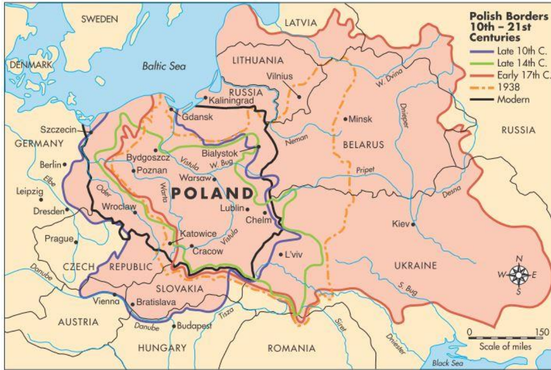
Polish Borders 10 th -21 st Centuries," Family Tree Magazine Genealogy Map Collection (CD); Researcher's Personal Copy