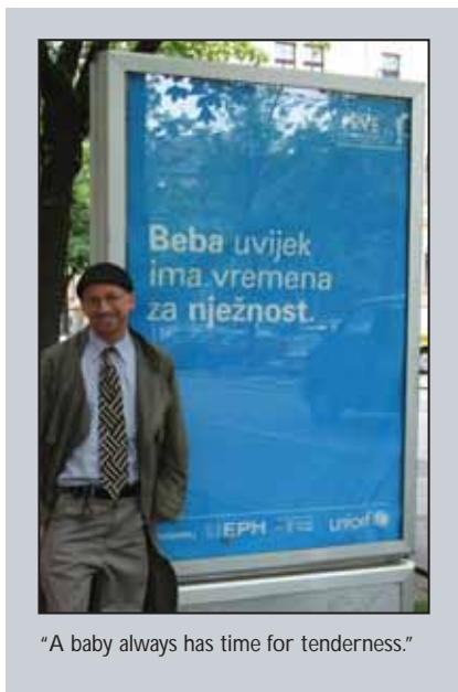
“A baby always has time for tenderness.”

More importantly, I hope to keep discussing these issues with friends and colleagues at ASU. While the intricacies of Balkan life may be somewhat remote to us in Arizona, the question of how small and embattled peoples can find peace and friendship in the modern world is too important to ignore.